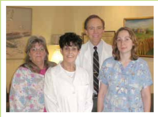
Our staff provides you and your family the best possible health care.